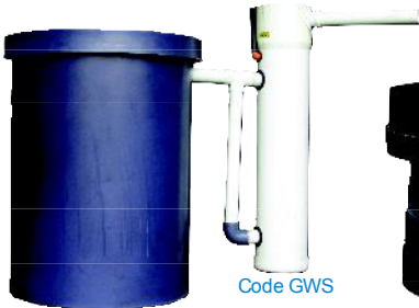
Code GWS2 - 5 Above Ground 200 - 500 litres