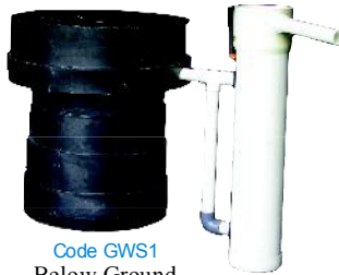
Code GWS1 Below Ground Nominal 240 to 1000 litres